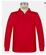
Red Long Sleeve Polo – With or Without School Logo