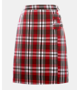
Double Tab Pleat Skort – All Grades