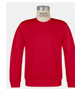
Red Crew Neck Sweatshirt – With or Without Logo