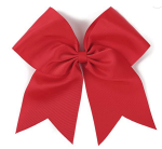
Solid Red, Black, or White Hairbow