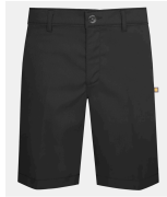
Black Shorts – Beginning of Year to October 31 & April 1 st to End of Year