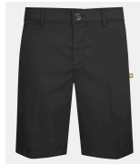
Black Shorts – Beginning of Year to October 31 & April 1 st to End of Year