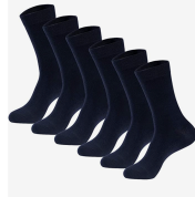
Solid Color White/Black Socks or Solid Color White/Black Knee-High Socks