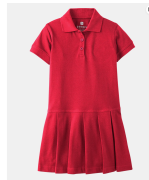
Pleated Pique Polo Dress - Only an option for Grades PreK - 1