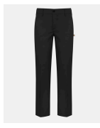
Black, Straight Leg, Flat Front, Dress Pants