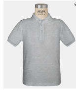
Grey Short Sleeve Polo – With or Without School Logo