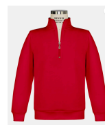
Quarter Zip Red Pullover Sweatshirt – With or Without Logo