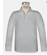
Grey Long Sleeve Polo – With or Without School Logo