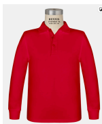
Red Long Sleeve Polo – With or Without School Logo