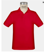
Red Short Sleeve Polo – With or Without School Logo