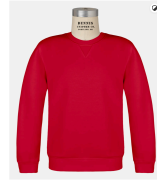
Red Crew Neck Sweatshirt – With or Without Logo