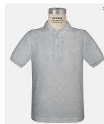
Grey Short Sleeve Polo – With or Without School Logo