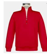
Quarter Zip Red Pullover Sweatshirt – With or Without Logo