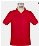
Red Short Sleeve Polo – With or Without School Logo